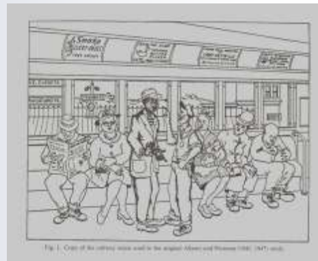
Fig. 1. Copy of the critical scene used in the original Allport and Postman (1945) study.